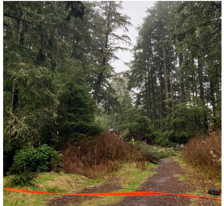
Photo of the 'old' Peninsula Rd. This road, now being the connector from The Cabins to Terrace Beach Resort, will be the future location of 13 cabins, with frontal, tree lined views of Terrace Beach, surrounded by a well documented site of well known midden. Below is an information plaque that can be found along the path on the beach.

If you are interested (or for more information), to receive herring please email Niamh.Oreilly@ufn.ca or call (250) 726-7342 ext 204. Please leave your name and number. Herring will be available to all citizens; urban citizens are asked to collect from hitaču.