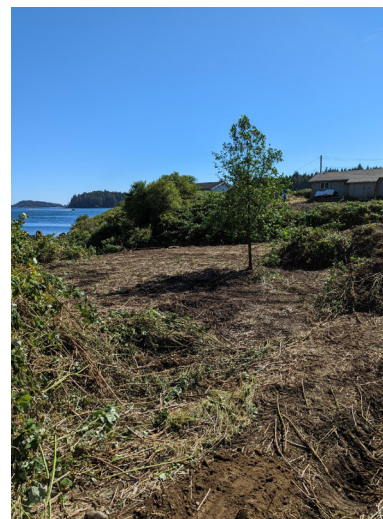
Park space has been cleared by the Assets Team!

We look forward to sharing more on the community projects and those involved in our next issue!