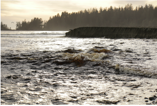
The stream of Lost Shoe Creek that meet the coastal waters of Florencia Bay beach.